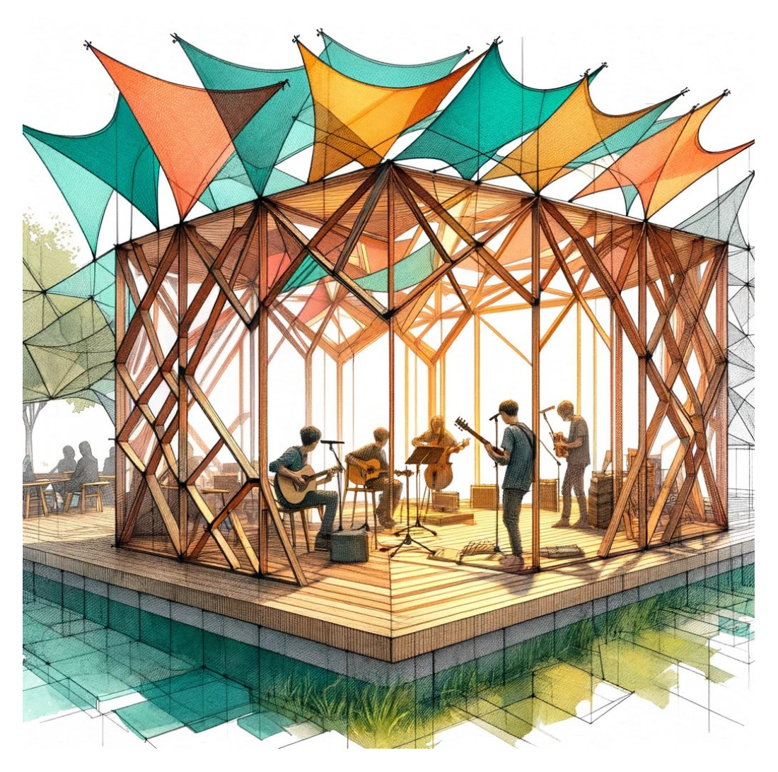
Figure 3 - Sketch for the scale of the pavilion