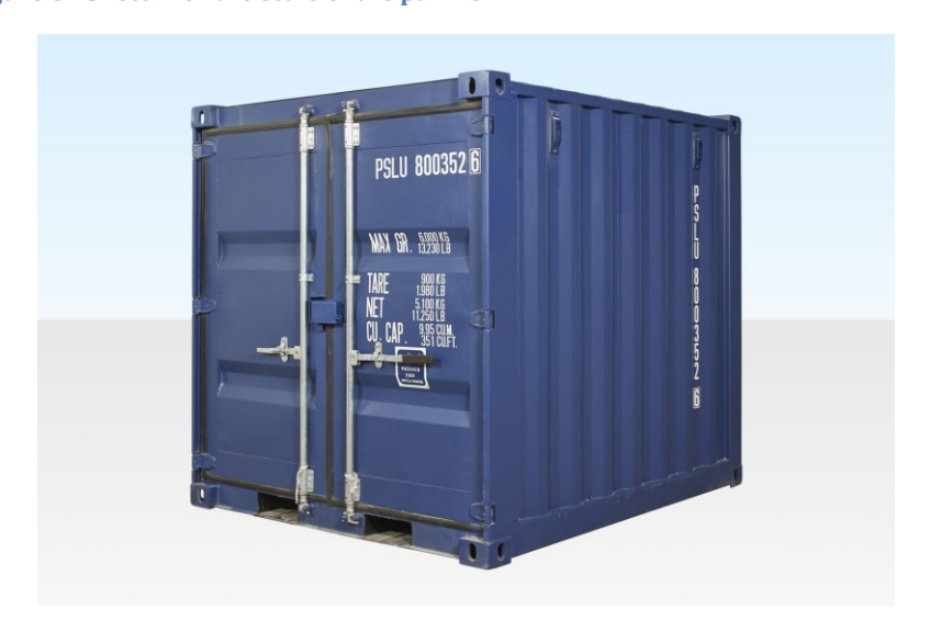
Figure 4 - There is an 8ft x 8ft shipping container which could be utilized.